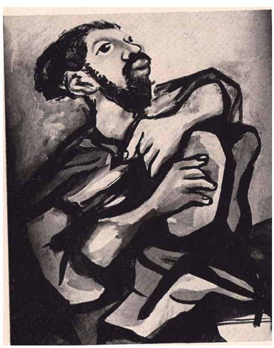
"Moses" published in The Magazine of Art, 1941