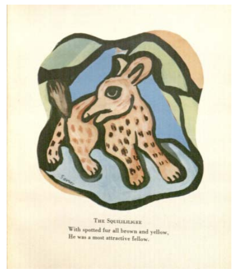
Sebree's "The Squilligee" from The Lost Zoo

The Squililigee is the only creature in Cullen's book granted this distinctive characteristic that serves a parallel function to Cullen's exclamation in the text: "Poor Squililigee!" While the loss of each creature is unfortunate, only the Squililigee elicits authorial emotion perhaps because his death is due not to accident or self-sacrifice, but borne of a rational evaluation of the pain of living. Although Cullen's book is marketed to children, it fails to condemn the Squililigee's decision to commit suicide, relying instead on one somber evaluation and the haunting "Sebree eye." Furthermore, Sebree's sensitivity to the Squililigee's plight may be founded on his personal experience swallowing criticism from his friends as well as his critics and trying his hand at a new method in his first and only foray into illustrating. But despite the array of color Sebree uses, his drawings, like that of the Squililigee, retain the tragic tinge that designates his style, as well as serving to remind the viewer that the narrative will not end well.